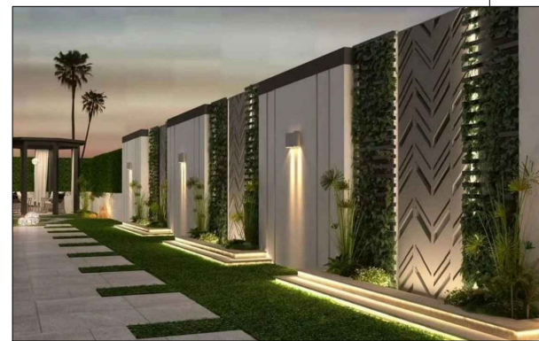
INNER BOUNDARY DESIGN